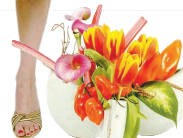
When stacked together, crinolated plastic pot liners form an unusual flower urn. Tulips and parsley add punch. ($1.50 EACH, GARDEN DISTRICT, 1801 14TH ST. NW; 202-797-9005)